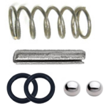
Tune Up Kit